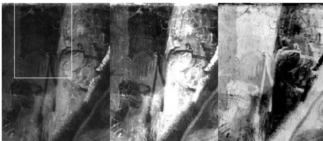
Fig. 7c. The inverting of the photo makes the position of the camera obscura clear