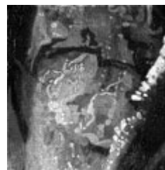
Fig. 5. Johannes Vermeer, The Art of Painting . Detail: laureate head

the painting. Nevertheless, closer observation of the corner shows that it should not be interpreted as part of the tapestry curtain. The edge of the curtain corresponds exactly with the place where the woven face also ends. Therefore, in contrast to typical paintings of curtains of this time, which created the impression that they were a constituent element of the pictorial space, this curtain does not reach right to the end of the pictorial space at the edge of the painting.