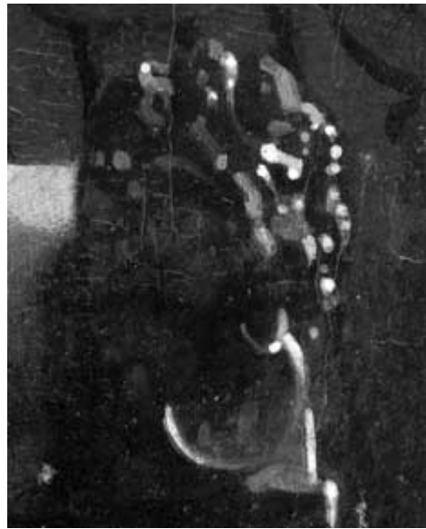
Fig. 1. Jan Vermeer, Girl with a Red Hat , oil on canvas, about 1655, Washington, National Gallery of Art. Detail: lions head of the chair armrest

This admittedly fictitious report, announced in 1991 by the journal Jahresring , was an adept parody of a long-term goal of research on the art of painting of Vermeer: to discover proof that the artist made use of a camera obscura during the planning and execution of his paintings. Since this cannot be proven by any concrete evidence in Vermeer's paintings, the supporters of this theory have repeatedly resorted to speculation.