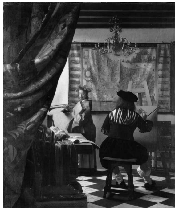
Fig. 3. Johannes Vermeer, The Art of Painting , about 1665/66, Vienna, Kunsthistorisches Museum

The next section has the aim of gradually directing our gaze towards the portrayal of a camera obscura, not previously perceived, in Vermeer's painting The Art of Painting . 1) The comprehensive literature on this work usually only describes the carpet-like curtain in the left third of the painting as being a massive unique element in the foreground of the picture that has the function of drawing the viewer into the