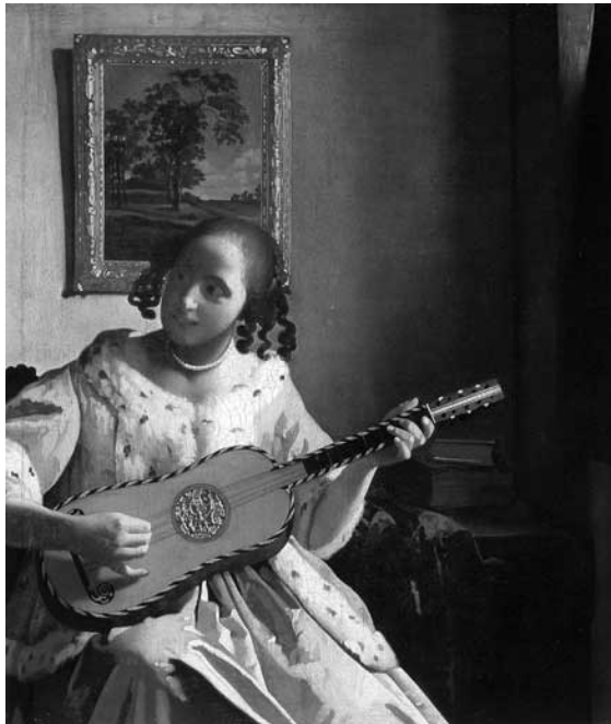
Fig. 2. Jan Vermeer, The Guitarplayer , oil on canvas, about 1667/72, London, Kenwood House

playing the instrument is also odd. This painting points most clearly to the use of a camera