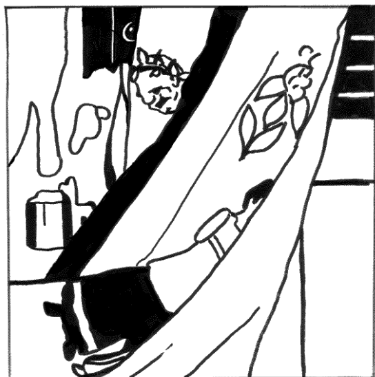
Fig. 6. Author, female figure, beaker, laureated head and camera obscura clarified in a draft

had movable retractable tubes and was around 75 hundredths of a Roman foot wide and about two foot long. If we define a Roman foot as 30 cm in length, then Zahn's camera would be roughly 22.5 cm high and wide and the