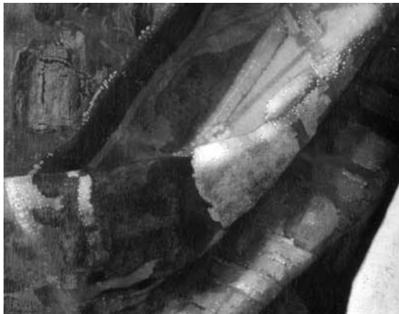
Fig. 4. Johannes Vermeer, The Art of Painting . Detail: female figure and beaker

half-concealed head to the right, is dressed in a light-blue upper garment and a dark skirt. These transposed colours make reference to the clothes